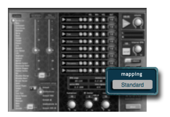
Figure 3.13: Mapping

Fill: Provides the execution of the options that are selected in fills area.