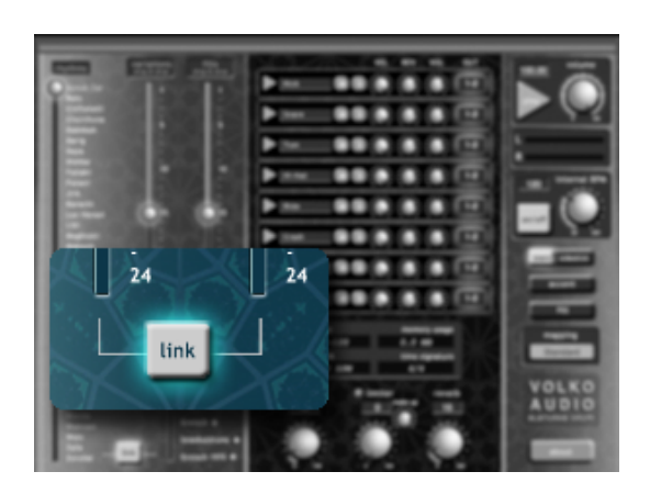
Figure 3.6: Variations – Fills Link

Variations – Fills Link: When selected provides running of variations and fills together.