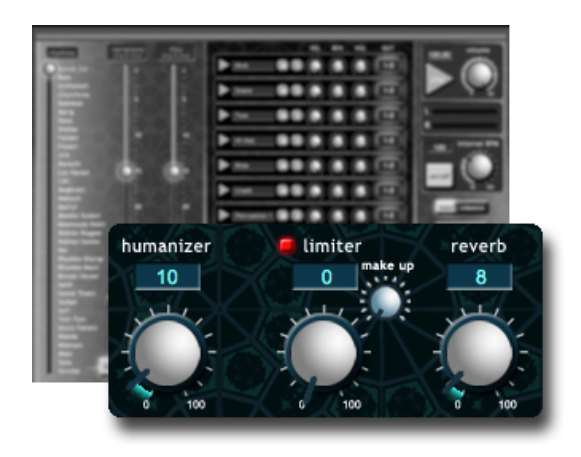
Figure 3.9: Humanizer – Limiter – Reverb

Time Signature: Shows the measurement information of the selected style.