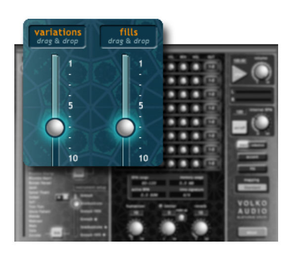
Figure 3.5: Variations & Fills

Rhythm – Instrument Link: When selected provides automatic adjusting of rhythm and instrument setup options. Every rhythm is written with a certain drum kit as base. When link is selected, that drum kit will be automatically chosen.