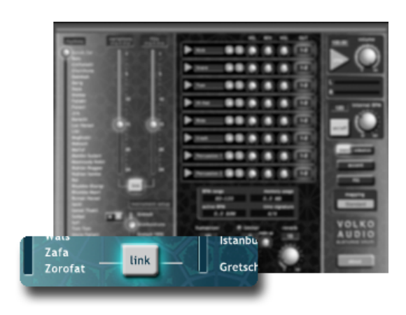
Figure 3.4: Rhythm – Instrument Link

Rhythm – Instrument Link: When selected provides automatic adjusting of rhythm and instrument setup options. Every rhythm is written with a certain drum kit as base. When link is selected, that drum kit will be automatically chosen.