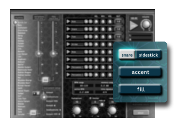
Figure 3.12: Snare/SideStick - Accent - Fill

Snare/SideStick: Maintains snare beats as rims.