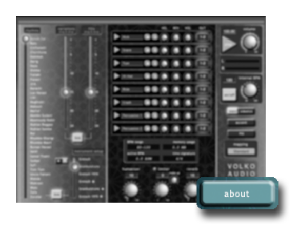
Figure 3.14: About

About: Shows version and credits information.