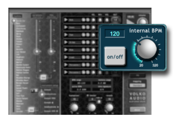
Figure 3.11: Internal BPM - On/Off

Internal BPM: Disables the link between the tempo of the host program with the tempo of the rhtym, by this way prowides tempo seperation. For instance, the drums of a record of 60 bpm can run with 120 bpm metronom.