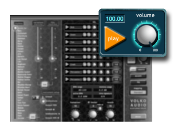
Figure 3.10: Volume – Play/Stop