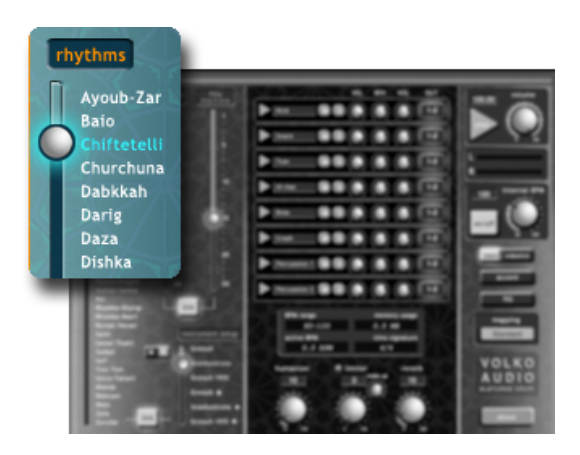
Figure 3.1: Rhythms & Styles

Rhythms: Selects the style to be played.