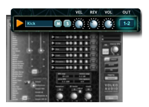
Figure 3.7: Grouping Mixer

Variations – Fills Link: When selected provides running of variations and fills together.