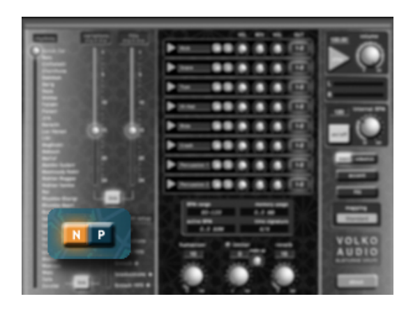
Figure 3.3: Natural/Processed

Instrument Setup: Selecs the drum kit. Three different drum kits with normal and wide options are available. The cymbals in normal kits consist of less velocity layers.