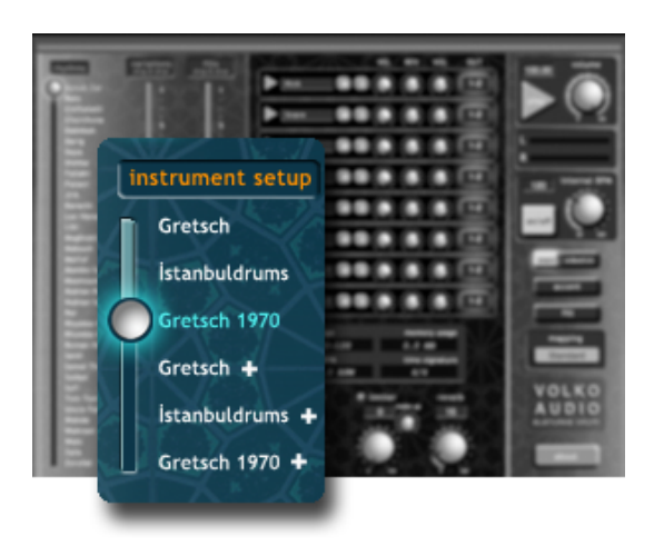
Figure 3.2: Instrument Setup

Instrument Setup: Selecs the drum kit. Three different drum kits with normal and wide options are available. The cymbals in normal kits consist of less velocity layers.